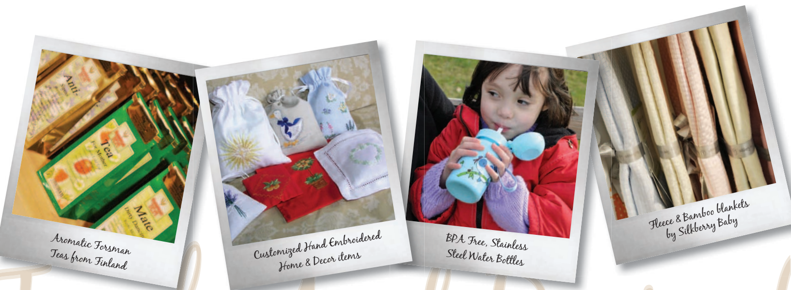
Aromatic Forsman Teas from Finland

For more information visit www.freshanddesired.com Call 1 (604) 298 2811 or email sales@freshanddesired.com to get started!