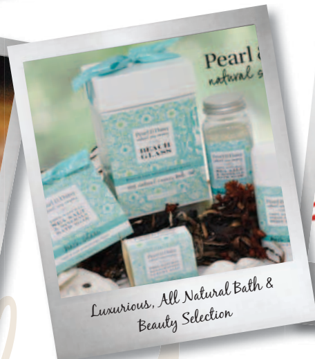
Luxurious, All Natural Bath & Beauty Selection