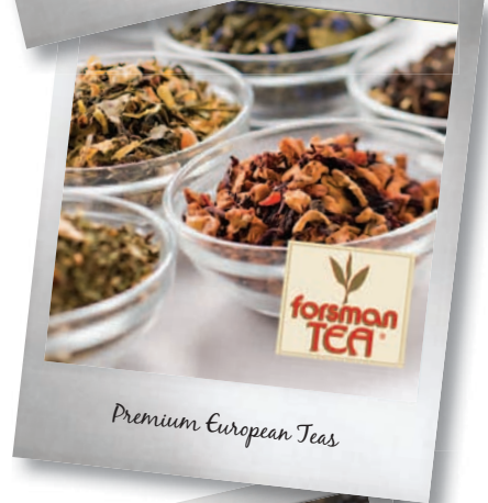
Premium European Teas