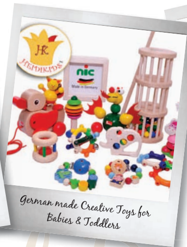
German made Creative Toys for Babies & Toddlers