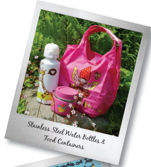
Stainless Steel Water Bottles & Food Containers

FAD continually sources local, national and international markets to bring the latest trend, the latest FAD to your stores. FAD currently works with the brands of Buffalo Natur, Fill Your Own, Forsman Teas, HeidiKids, Mitt-ONS, Pearl & Daisy Natural Soap Company, Shevron Cards and Silkberry Baby.