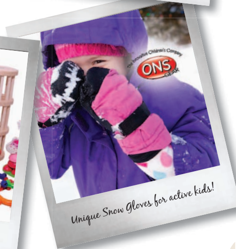
Unique Snow Gloves for active kids!