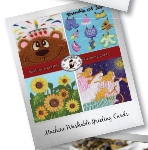
Machine Washable Greeting Cards