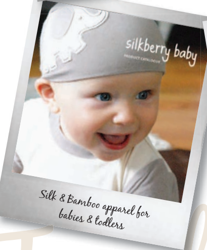
Silk & Bamboo apparel for babies & toddlers